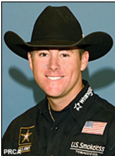
Trevor Brazile

In 1954, the Big Four started discussing a cash prize for the cowboy winning the most points at the four rodeos. The prize would recognize the rodeos' historical relationship, confirm their status among the nation's premier rodeos, provide an incentive for cowboys to enter